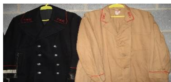
Left: Uniform overcoat and jacket – winter and summer?

As we promised in our last edition here are some Yorkshire Woollen gems that we have uncovered during the tidying of the Archive: