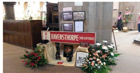
Right: Our display in the church (& flowers)

We had a recent request from St Saviour's church at the end of the road to support their 150 year celebration. An exhibition and flower festival took place in late September and to celebrate the occasion a display of transport related materials was requested. Without hesitation we assisted and a special thank you must go to Simon Turner whom willingly loaned items from his extensive personal Yorkshire Woollen collection.