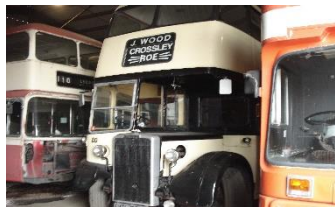
Hidden away in a dark shed