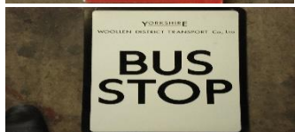
Left: Distinctive Bus Stop

If you have any items you would like to donate please bring them to the Museum.