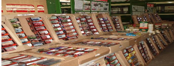
Left; 800 models ready to sell!