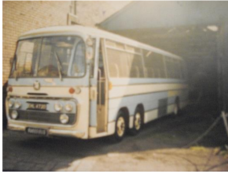
Resting at Ravensthorpe, what a lovely sight.