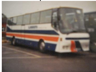
Bedfords out and Bova's in!