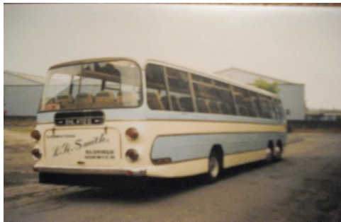
What a rear end, typical 1960's styling.