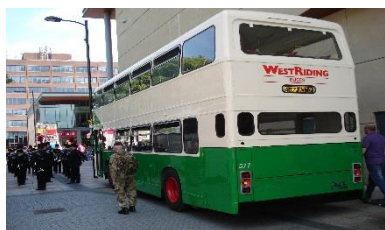
Left: unveiled to the sound of a marching band!