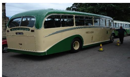
Right; Ethel coach EHL 336 back in Wakefield

To end our autumn newsletter we thought we would share the “rear end ” of a superbly restored coach.