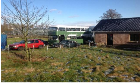
Left; out to grass.