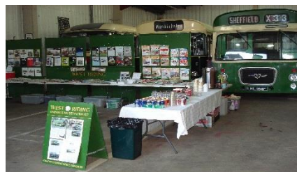
Right; all set up and ready for action