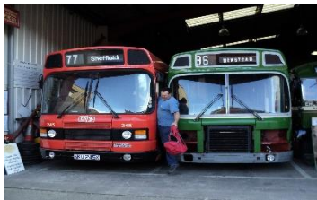
Left; Simon Turner admires the Nationals!

After a day out with Tracky 245 she visited Ravensthorpe for an overnight stay. An opportunity to re-unite her with West Riding 73 was taken. These two ladies would have often rubbed shoulders in Wakefield Bus Station so here they are close together once again.