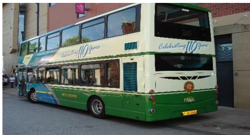
Left; Arriva "unzipped" for the first time

To celebrate 110 years of West Riding Arriva have provided a vehicle in a special livery and they displayed it just behind Trinity Walk. To promote the Heath Common event on the following day we also took along the PD2 and Olympian.