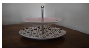
Left: imagine this loaded up with Irene's scones

For the uninitiated (probably most of us) here is the sort of thing she is after!