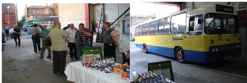
Left; a visitor!

Below: visitors enjoying a coffee stop and chatting to the Trustees