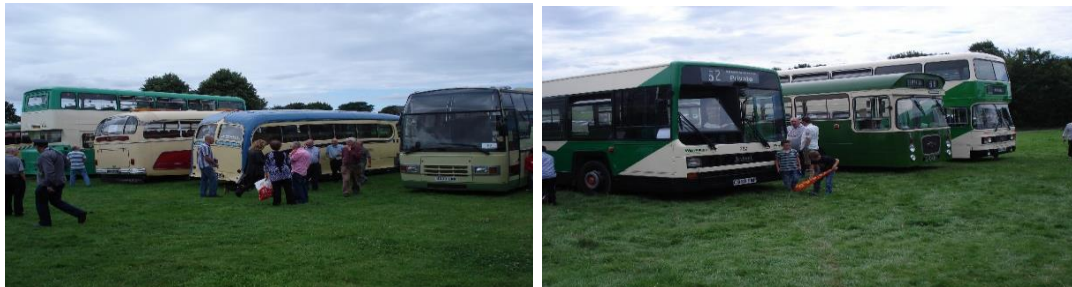
Above: Vising buses mixed with Museum exhibits and a West Riding line up

The Museum heavily supported this event and as can be seen in the shots below a great time was had by all. Over 3500 passenger journeys took place.